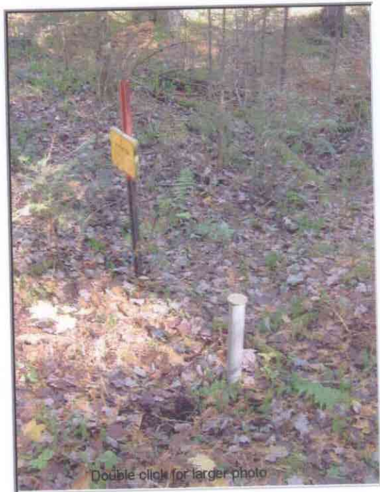
Photo of Monument

DISCLAIMER NOTE: This project involved a reconnaissance recovery of suspected PLSS corners – it is not to be construed as comprehensive retracement and recovery. This may or may not be the correct location of said PLSS corner. This location can only be used for a PLSS Inventory Assessment.