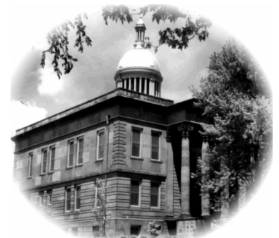
Bayfield County Courthouse Built 1908

Program funding may be used for capital expenses including: site acquisition; new buildings, additions to or renovations, furnishings, equipment and initial collection (print, non-print and electronic) for new buildings, building additions, or building renovations; Computer hardware and software used to support library operations and other one-time major products.